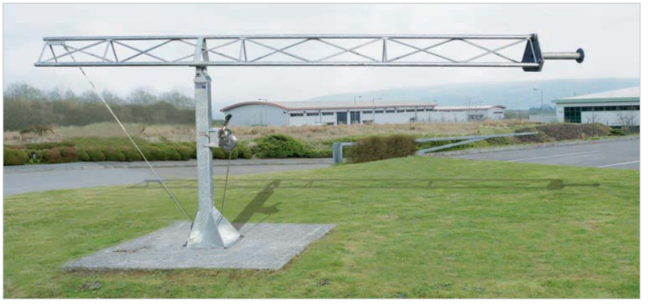
ACTI BP in tilted position