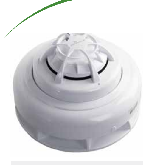
XPA-CB-14019-APO XPander Combined Sounder and Multisensor Detector