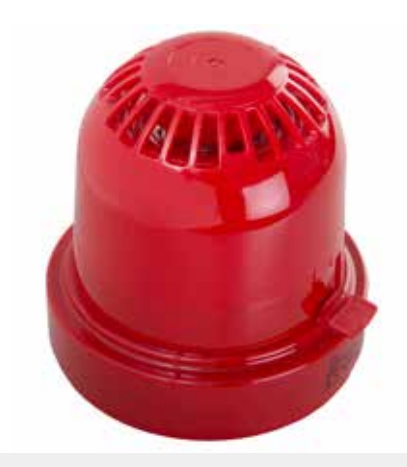
XPA-CB-14001-APO XPander Sounder and Sounder Base