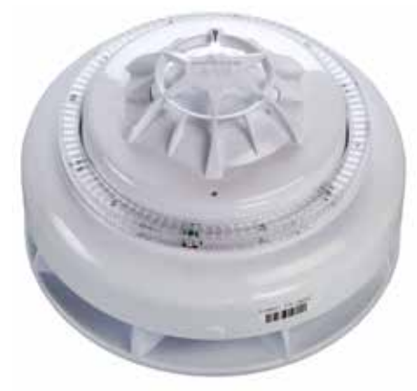
XPA-CB-14025-APO XPander Combined Sounder Visual Indicator (Clear) and Heat Detector (Class A1R)