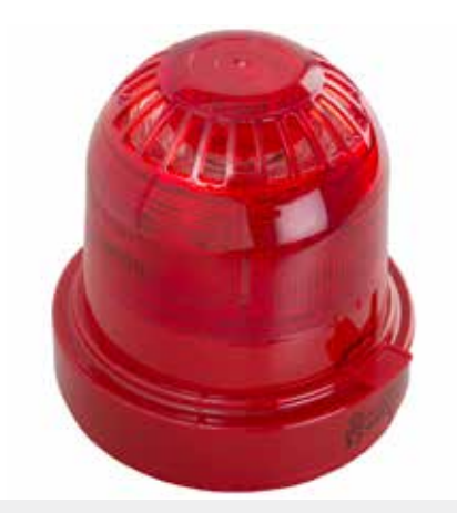
XPA-CB-14003-APO XPander Sounder Visual Indicator and Sounder Base