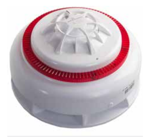
XPA-CB-14021-APO Combined Sounder Visual Indicator (Red) and Heat Smoke Detector