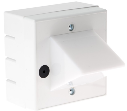
Sounder / Beacon Receiver

Complies with EN300 220-3 and En 301 489-3