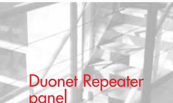
Duonet Repeater panel