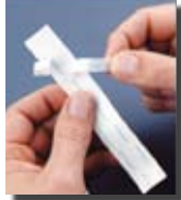
Easy-peel split-back label