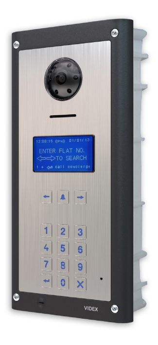
Art.4212RV + Art.4852

Vandal Resistant 4212 series audio and video digital call panels for the VX2200 digital system.