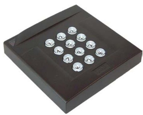
Exsmart<sup>≥</sup> K MIFARE® reader with keypad