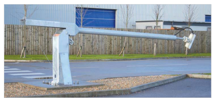
AW1545/8/BAS AW I 545/6TD/BAS in tilted position