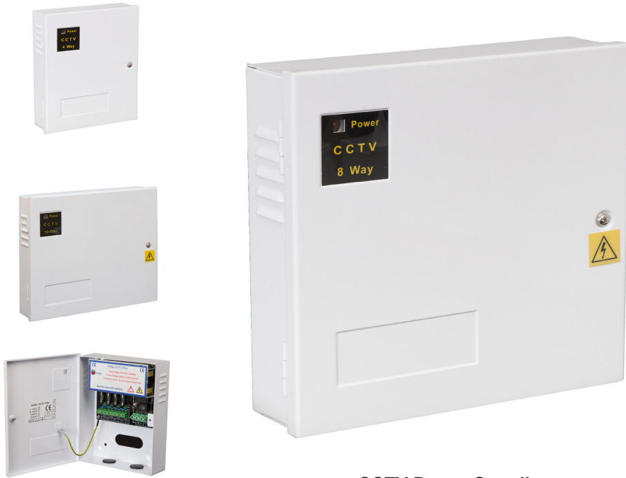
CCTV Power Supplies