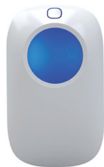
Remote Control Keyfob