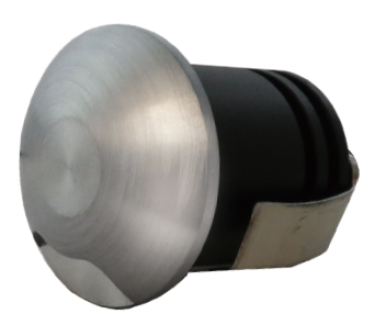
PRODUCT CODE: ELLA-EYE-BZL (Sold Separately)