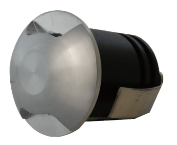
PRODUCT CODE: ELLA-UD-BZL (Sold Separately)