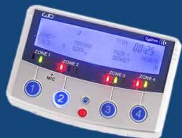
GJD910 DygiZone 4 Zone Lighting Controller