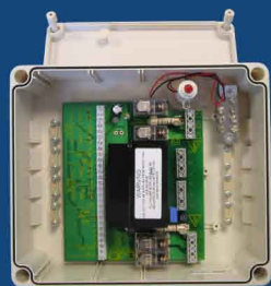
GJD040 4 Zone Expansion Unit