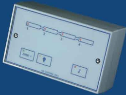
GJD005 Sapphire 1500 MK3

“STEPPING INTO THE LIGHT: A SENSE OF SECURITY”