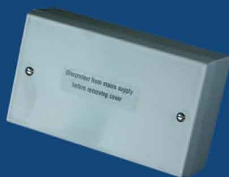
GJD012 Solitaire 2 Zone Expansion Unit