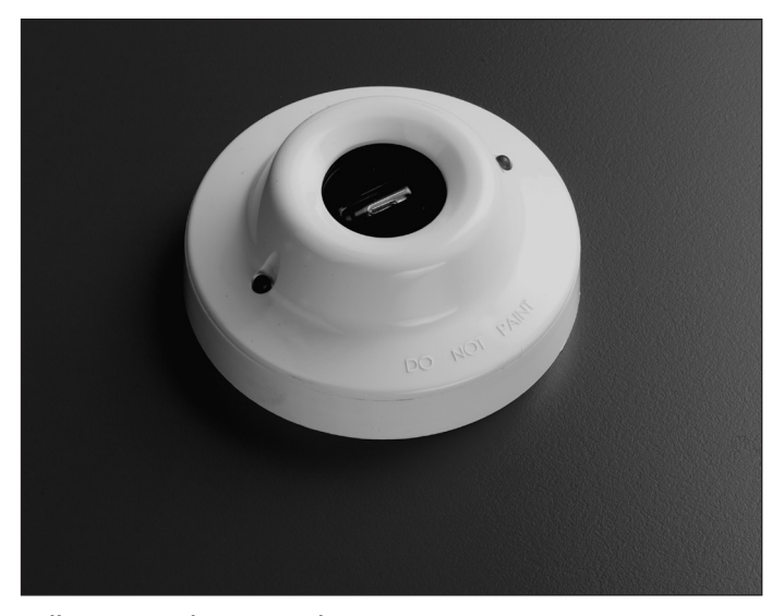
Illustration shows UV Flame Detector

Caution: The detector will also detect electrical discharges from lightning or arc welding.