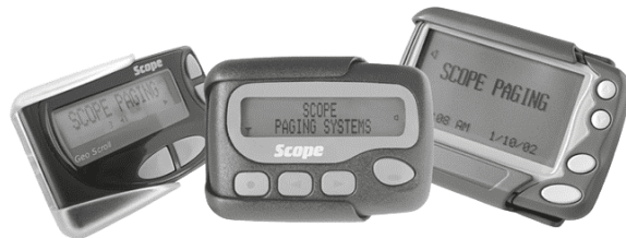
Scope Text Pagers