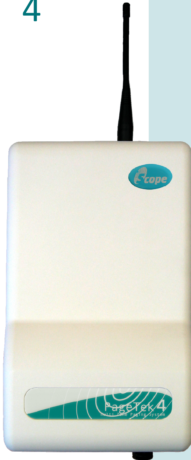
PageTek 4 Mains model