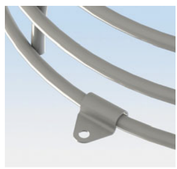
Supplied with heavy duty easy install quick fit clamps and screws