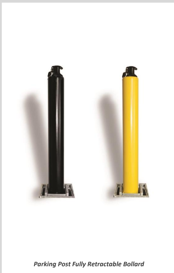
Parking Post Fully Retractable Bollard