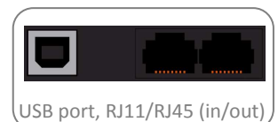
USB port, RJ11/RJ45 (in/out)