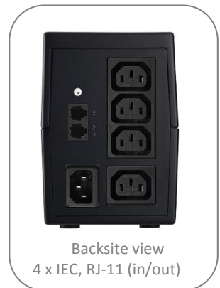
Backside view 4 x IEC, RJ-11 (in/out)