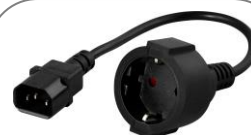
Optional Accessory: IEC -> Schuko Converter Item Nr.: 91015003