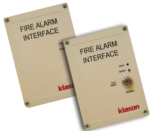
Fire Alarm System