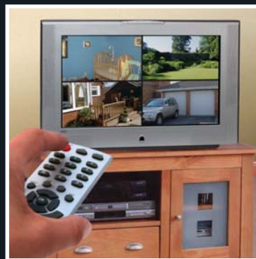
HOME - using standard or HD TV