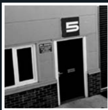
Black & white with IR lighting at night