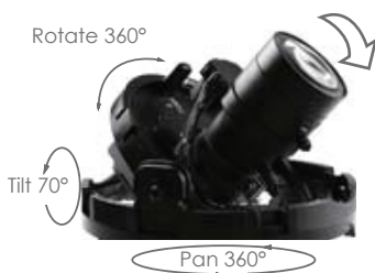
3-Axis Gimbal Chassis