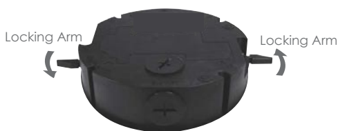
Flush mount made easy with the extending locking arms