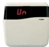
Gardtec Countour LED RKP

ACE utilises the highest form of security and with up to 14 keyfobs per system it's ideal for commercial and domestic premises.