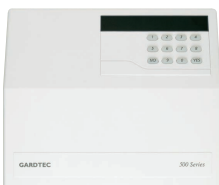
Gardtec 581 Control Panel