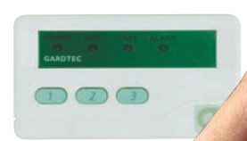
Gardtec ACE Receiver