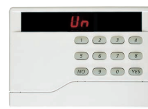
Gardtec 500 Traditional Keypad