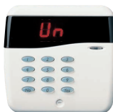
Gardtec Profile RKP