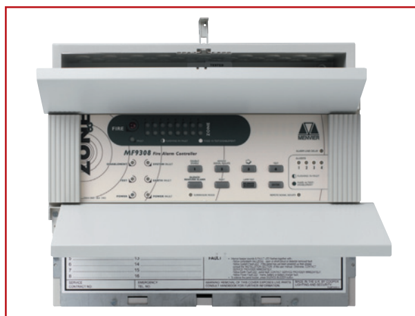
Simple access to battery and terminals