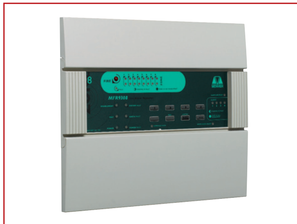
MF9300 matching repeater