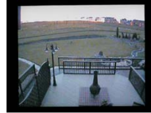
Our VLL camera

The above images were taken at midnight with the light measurement of 0.03 Lux