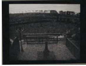
High end colour/mono